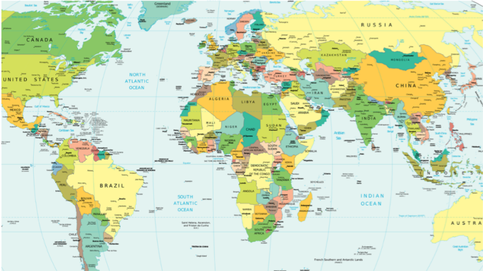
Map of the World 2017